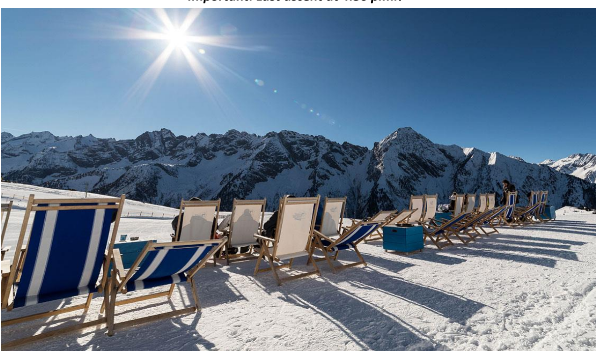
Important: Last ascent at 4:30 p.m.!

While the last visitors of the day ski down the 5.5-kilometer-long Ahorn run towards the valley, our overnight guests will be taken up to the Ahorn Plateau by the Ahornbahn, covering a distance of 3 km. You'll enjoy a sensational view while being whisked up to almost 2000 meters in Austria's largest cable car!